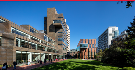
Barnard College, Columbia University