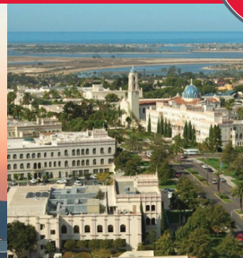
University of San Diego