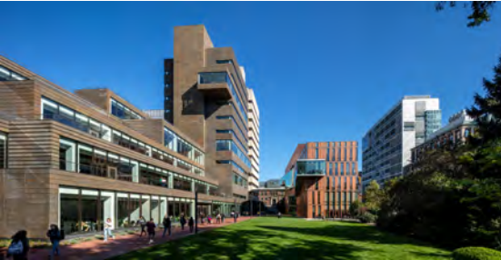
Barnard, Columbia University