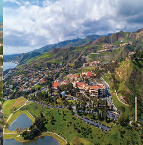
PU Los Angeles