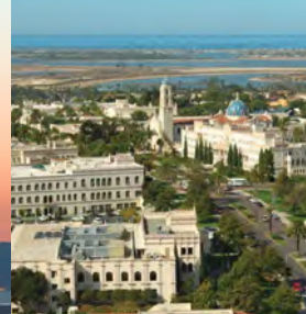
University of San Diego