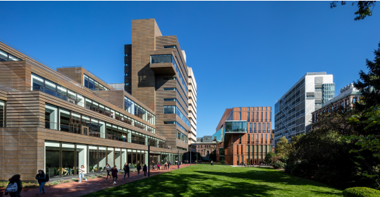
Barnard, Columbia University