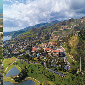
PU Los Angeles