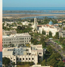
University of San Diego